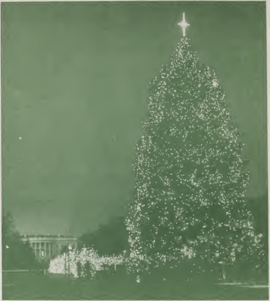
This white spruce tree from New York State was the National Christmas Tree in 1964.